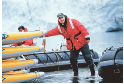
The expedition staff helps guests board kayaks safely and swiftly.

Many are veteran polar guides who have worked with us for decades, chosen for their extensive knowledge of subjects like geology, wildlife biology, and climate science. They, along with the guest speakers who join us on board, give rich context to the wildlife and landscapes we encounter ashore.