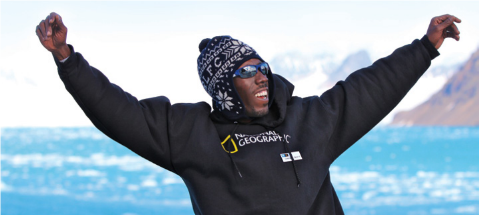
A guest marvels at landscape from aboard the ship.