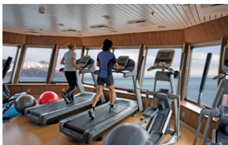
Fitness center with panoramic views.

The vessel is staffed by a wellness specialist and features a glass-enclosed fitness center, outdoor stretching area, LEXspa treatment room, and sauna.