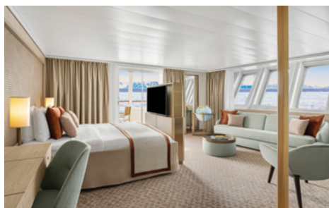
Newly renovated Category 7 suite with balcony.

All cabins and suites face outside with windows or portholes, and have a private bathroom and climate controls. Equipped with Wi-Fi, multiple electrical outlets, USB outlets, full-length mirror, and phones. TV featuring entertainment on demand, live feed from onboard presentations, bow camera, and ship's position. Luxury bed linens and pillows. Botanically inspired shampoo,