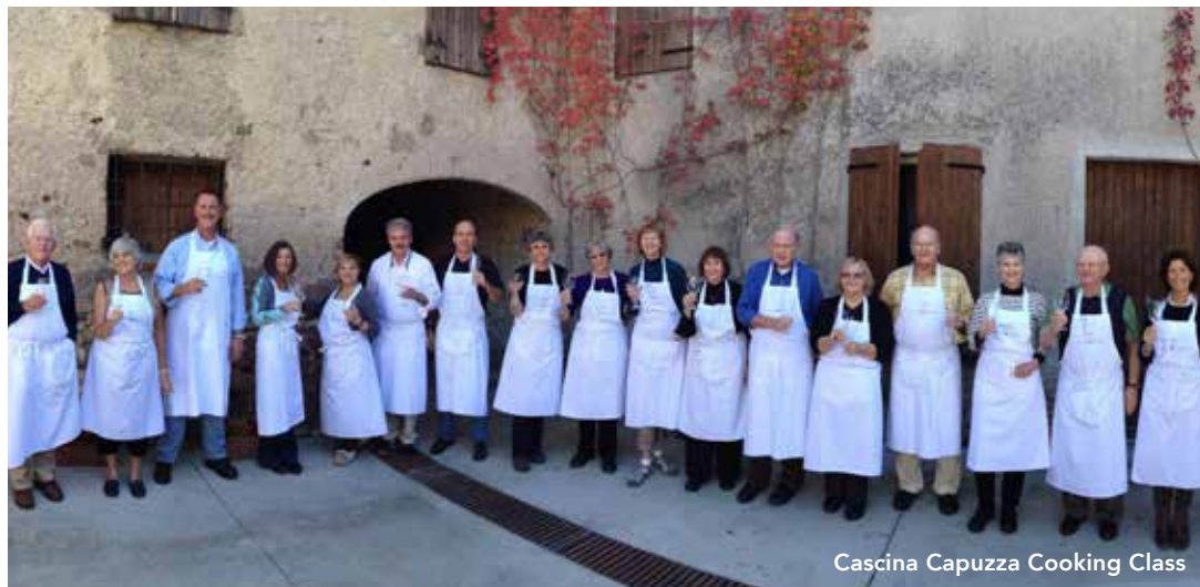
Cascina Capuzza Cooking Class