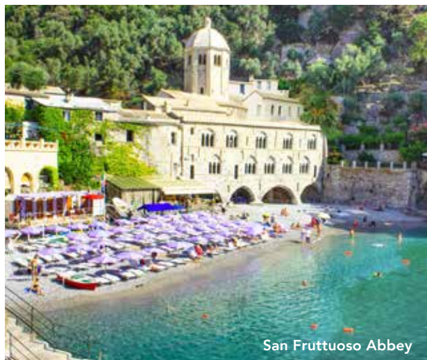
San Fruttuoso Abbey