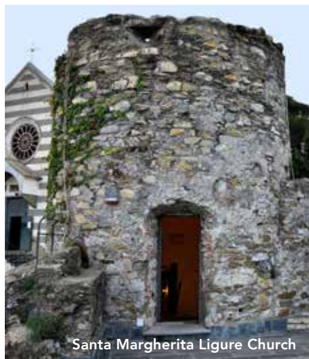
Santa Margherita Ligure Church