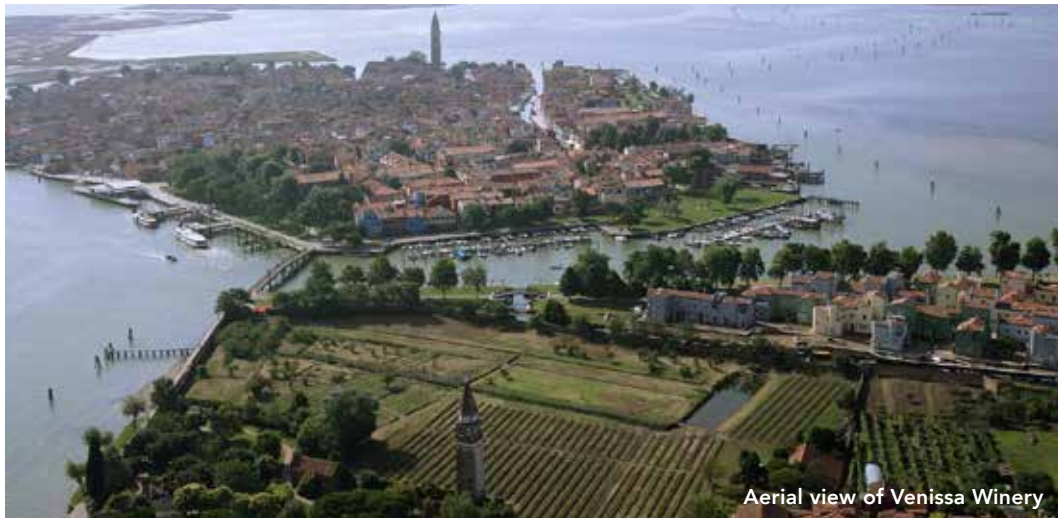
Aerial view of Venissa Winery