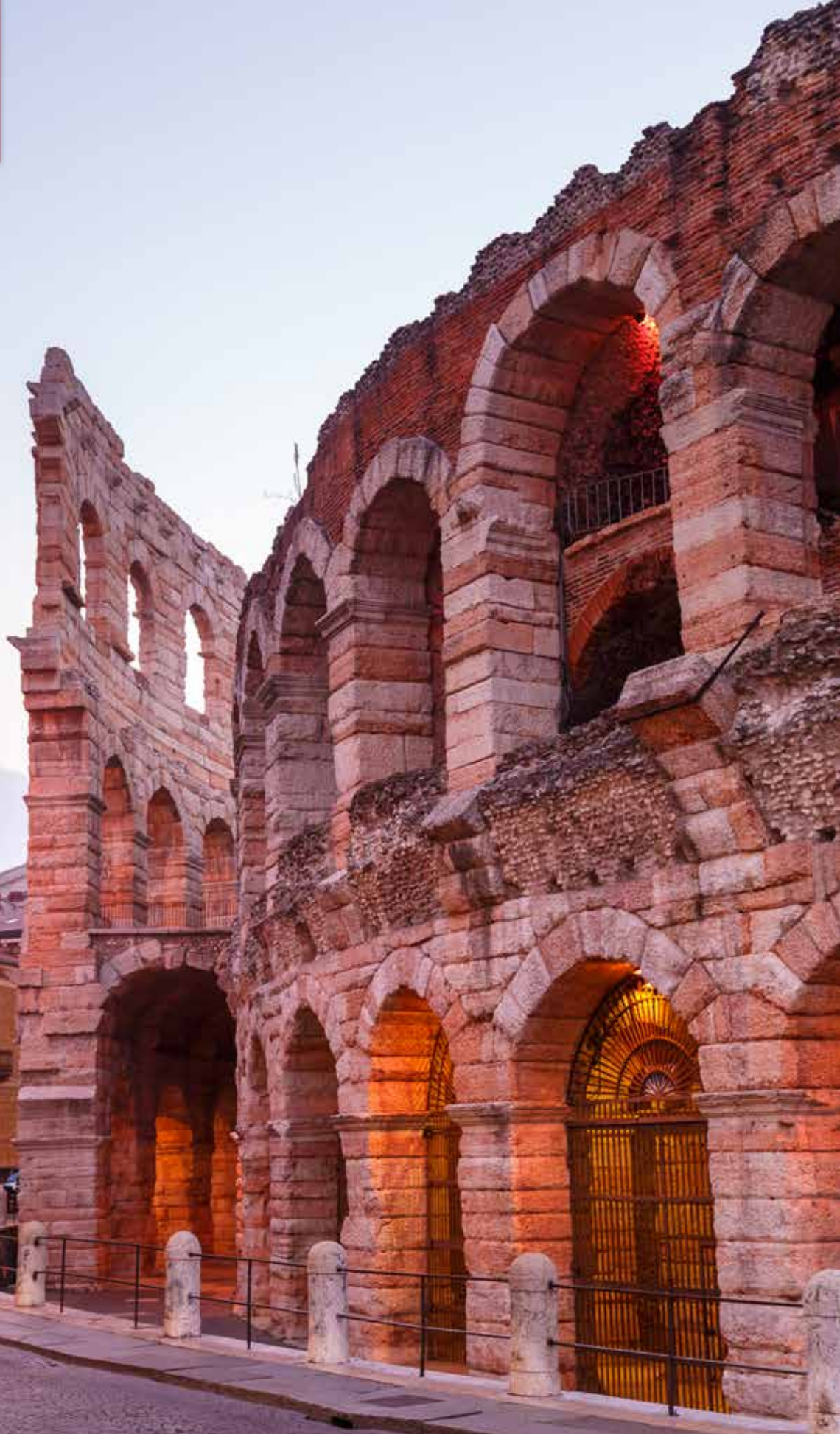
Colosseum Arena di Verona