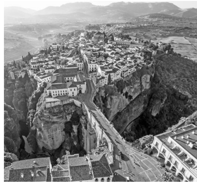
El Tajo Gorge, Ronda