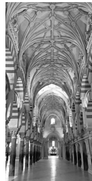
La Mezquita, Córdoba

Knowledgeable Lecturers deepen your appreciation for the region and its history, culture and current events.