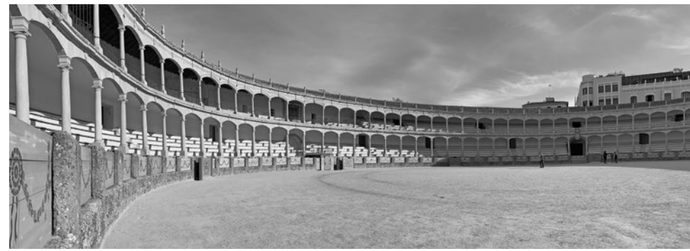
Plaza de Toros, Ronda

CA Seller of Travel Reg. No. 2028271-20. FL Seller of Travel Reg. No. ST-33300 IA Seller of Travel Reg. No. 520. OH Seller of Travel Reg. No. 8889139. WA Seller of Travel Reg. No. 601-820-781. PARTICIPATING AIRLINES—all IATA and ARC Member Carriers ©2023 AHI Travel Printed in the USA