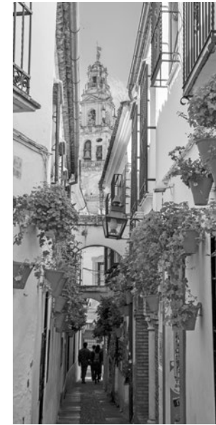
Jewish Quarter, Córdoba