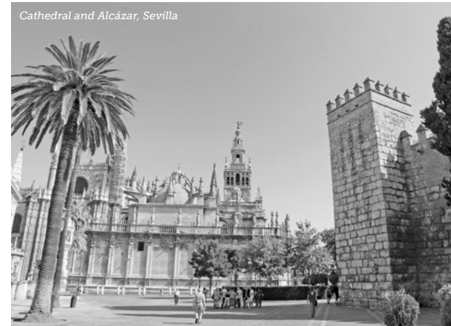
Cathedral and Alcázar, Sevilla