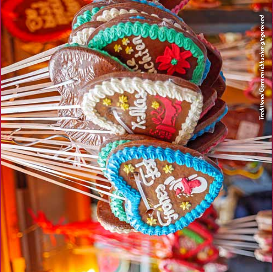
Traditional German Lebkuchen gingerbread

PRSR1 STD U.S. Postage PAID Gohagan & Company