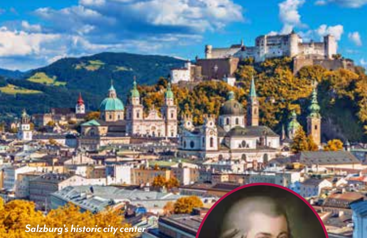
Salzburg's historic city center