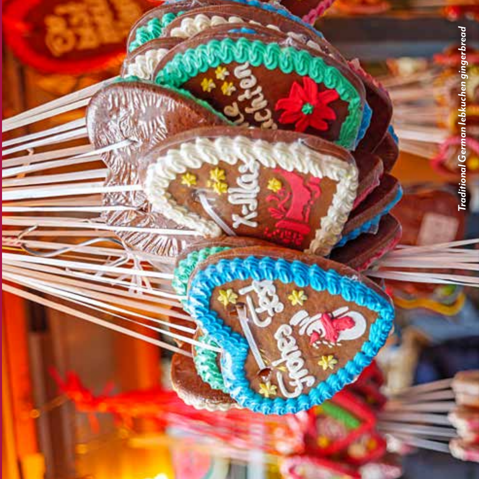
Traditional German lebkuchen gingerbread

PRSRRT STD U.S. Postage PAID Gohagan & Company