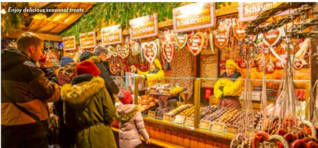
Enjoy delicious seasonal treats

Disembark the river boat and transfer to the airport for a flight back to your home city. (B)