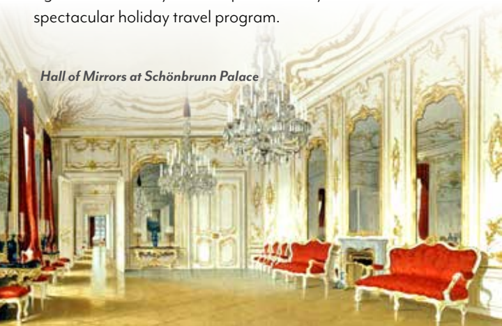
Hall of Mirrors at Schönbrunn Palace

At the age of 5, Wolfgang Amadeus Mozart had already started composing music, and by the time he was 6, had played for the imperial family at Schönbrunn Palace in Vienna. As we visit some of the most historic Christmas markets in Europe, our unique itinerary will simultaneously trace Mozart's life story. See the magnificent Vienna State Opera House—which opened in 1869 with Mozart's "Don Juan" to an audience that included Emperor Franz Joseph and Empress Elisabeth—and visit the Hall of Mirrors at Schönbrunn where the boy prodigy famously charmed Maria Theresia. Our tour of the Baroque Austrian capital also includes the iconic St. Stephen's Cathedral, or Stephansdom, where Mozart married Constanze Weber in 1782. Another itinerary high note is a visit to the UNESCO-inscribed city of Salzburg, where Mozart was born in 1756 and lived with his family on the third floor of the Hagenauer House at Getreidegasse No. 9. Reflect on the master's incredible legacy as you stroll past his childhood home and on to the majestic Dom Cathedral, the site of his baptism. Mozart died in Vienna in 1791, the same year he composed "The Sleigh Ride," a joyous piece that evokes a beautiful winter scene with sleigh bells and trumpets—sights and sounds you will experience for yourself on this spectacular holiday travel program.