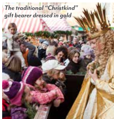
The traditional “Christkind” gift bearer dressed in gold

The concept of an open-air fair in December dates to 13th century Vienna, when Duke Albrecht I granted permission for a market that would allow townspeople to gather supplies for the winter ahead. While historians say there is no evidence that this medieval market had any connection to religion, the popularity of the wintermärkte spread through German-speaking regions during the Middle Ages. By the 16th and 17th centuries, as festive Christmas celebrations became popular in Austria and Germany, the winter market evolved into the more elaborate spectacle now known as the Christkindlmärkte —which translates to “Christ child market.” The market stalls began filling up with delectable treats and hand-crafted Christmas nutcrackers, wood carvings, and other ornaments. Nuremberg’s lavish Christkindlesmarkt , which you will visit on our tour, has been operating since at least 1628. In addition to Old World Christmas decorations, the market is renowned for preserving the city’s famous rostbratwurst and the 17th century lebkuchen gingerbread. Today, these centuries-old traditions continue through Europe with sparkling lights, boughs of fresh pine, roasted chestnuts, mugs of glühwein , and the sound of Christmas carols filling the air.