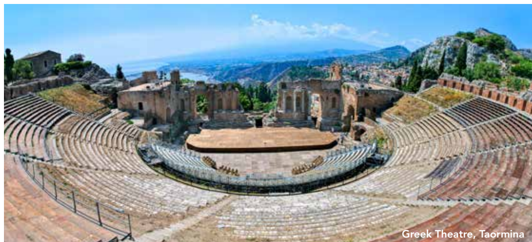
Greek Theatre, Taormina

Activity Level: Guests should be able to enjoy two hours or more of walking, be sure-footed on cobbled surfaces, and walk up and down hillsides and stairs without assistance.